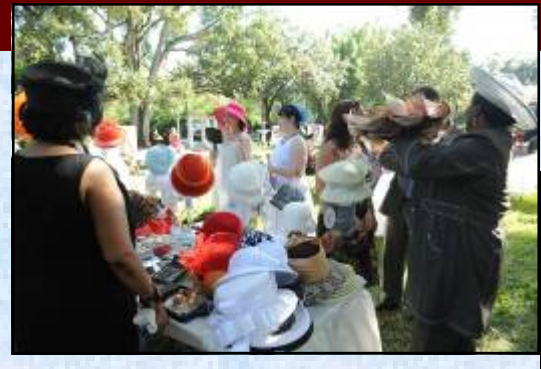
Faces & Voices of Domestic Violence Survivors